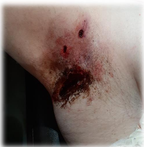
Immediately Post Deroofing